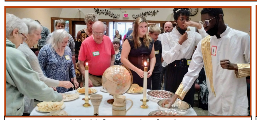
World Communion Sunday