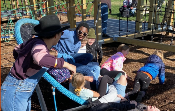
All Seasons Youth Event